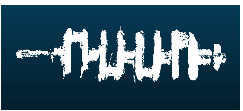
Figure 2. Point cloud from worn crankshaft

The collaboration between AIMEN, TMCOMAS, and Ziknes marks the beginning of an exciting journey towards innovation in the Oil & Gas sector. By automating crankshaft repairs and introducing new methodologies, they are reshaping the industry landscape. With a shared commitment to efficiency and sustainability, this partnership is poised to make a significant impact.